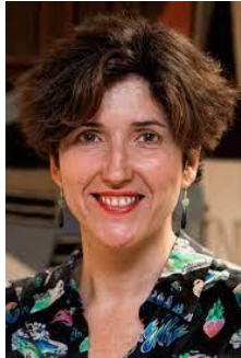
Adriana Moscoso del Prado

Directora General de Industrias Culturales, Propiedad Intelectual y Cooperación. La Dirección General de Industrias Culturales y Cooperación tiene entre sus principales funciones el diseño de las políticas de promoción de las industrias culturales y de acción y promoción cultural, en dimensión nacional e internacional, así como la defensa y protección de la propiedad intelectual.