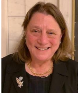
Jane C. Ginsburg